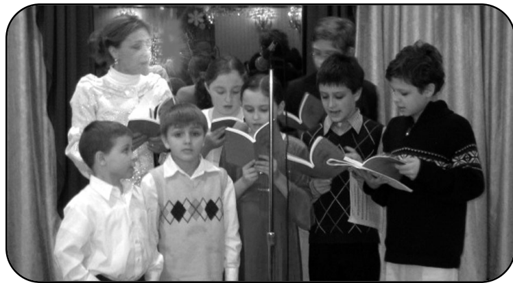
Children from Holy Innocents Parish singing Christmas carols

This year February 6, Ash Wednesday will mark the beginning of the Lenten Season. It is a time to prepare for Easter by reflecting on the meaning of Christ's death and resurrection. In Lent, we journey with Jesus to the cross. We reflect on the example He gives us of selfless and total love. During Lent we make a special point of denying ourselves, serving others and developing a closer union with God. Lenten discipline is meant to help us appreciate what love and service really mean. May our Lenten journey draw us closer to Christ's love and strengthen us within. May this sacred forty days truly show us the way and lead us to resurrection.