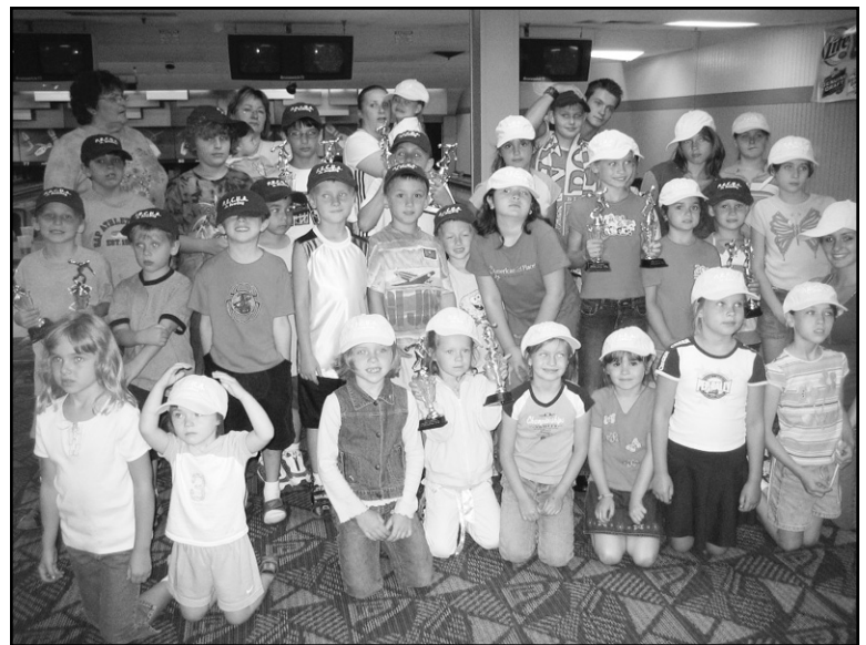
Participants in the 2006 Junior Bowling Tournament